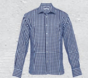
THC: NAVY/WHITE PAGE 20