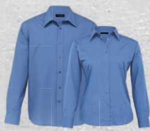
EOE, WEOE: MID BLUE PAGE 10