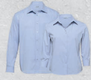
TU, WTU: BLUE/WHITE PAGE 12