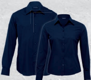
TRLS, WTRLS: NAVY PAGE 50