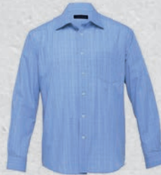
PW: BLUE/WHITE PAGE 30