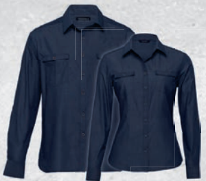
TG, WTG: INDIGO PAGE 58