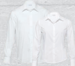
TRLS, WTRLS: WHITE PAGE 50