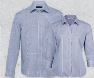
TF, WTF: WHITE/NAVY PAGE 22