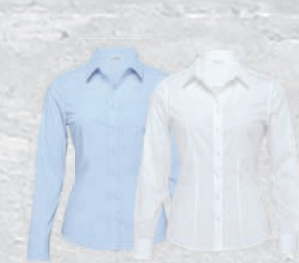
WTMO: EGGHELL, WHITE PAGE 44