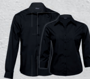
TE, WTE: BLACK PAGE 46