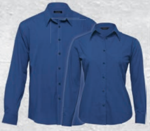
EOE, WEOE: FRENCH BLUE PAGE 10