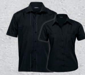
TL, WTL: BLACK PAGE 48