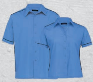
TMT, WMT: OCEAN/NAVY PAGE 60