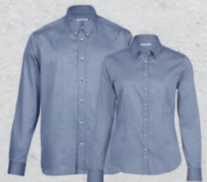
TBT, WBT: STEEL NAVY PAGE 4