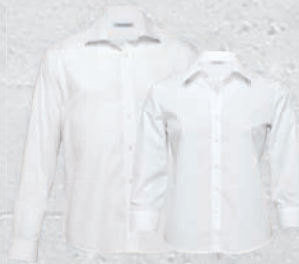
TE, WTE: WHITE PAGE 46