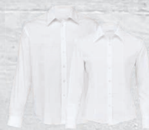
TV, WTV: WHITE PAGE 42