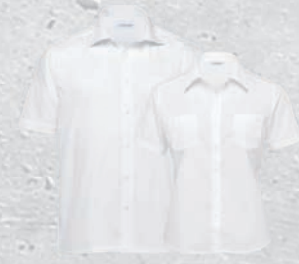
TL, WTL: WHITE PAGE 48