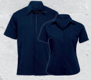
TRSS, WTRSS: NAVY PAGE 52