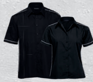
TMT, WMT: BLACK/WHITE PAGE 60