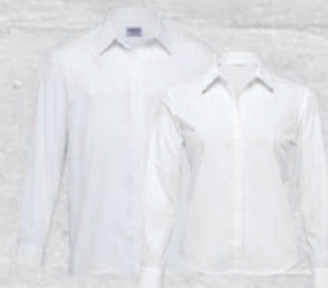
TEL, WTEL: WHITE PAGE 40