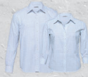
TAX, WTAX: WHITE/MID BLUE PAGE 24