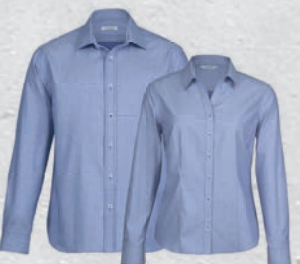
TFL, WTFL: NAVY/WHITE PAGE 8