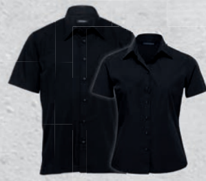
TRSS, WTRSS: BLACK PAGE 52