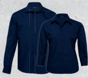
TE, WTE: NAVY PAGE 46

Our wide range of men's and women's woven shirts offer you a selection of his and her styles to create your working wardrobe. The Standard offers coordinating colour pallets to create a cohesive, well tailored look for your business uniform.