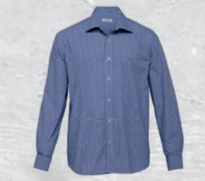
TSC: NAVY/WHITE PAGE 26