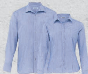
TYS, WTYS: BLUE/WHITE PAGE 34