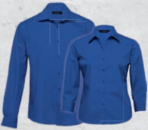
TE, WTE: FRENCH BLUE PAGE 46