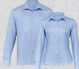
TNP, WNP: BLUE/WHITE PAGE 6