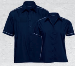
TMT, WMT: NAVY/WHITE PAGE 60