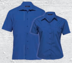
TL, WTL: FRENCH BLUE PAGE 48