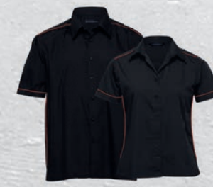
TMT, WMT: BLACK/RED PAGE 60