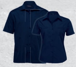
TL, WTL: NAVY PAGE 48