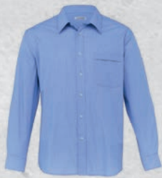
TTBL: BLUE/WHITE PAGE 14