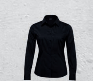
WTMO: BLACK PAGE 44