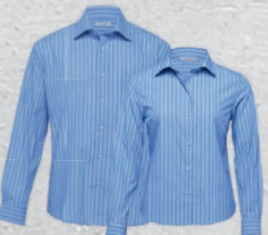
ES, WES: BLUE/WHITE PAGE 38