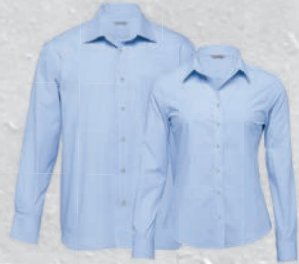
TBC, WTBC: SKY/WHITE PAGE 18