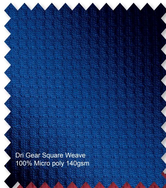
Dri Gear Square Weave 100% Micro poly 140gsm