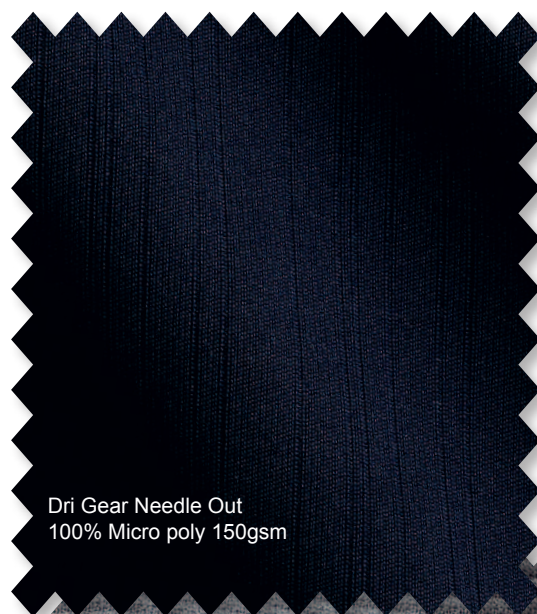
Dri Gear Needle Out 100% Micro poly 150gsm