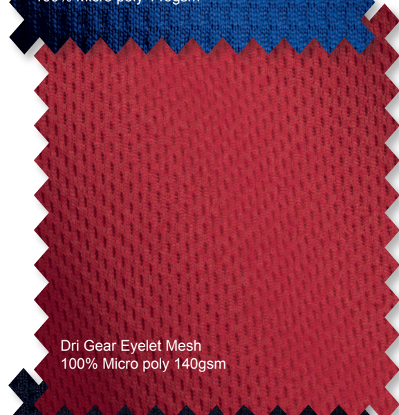
Dri Gear Eyelet Mesh 100% Micro poly 140gsm