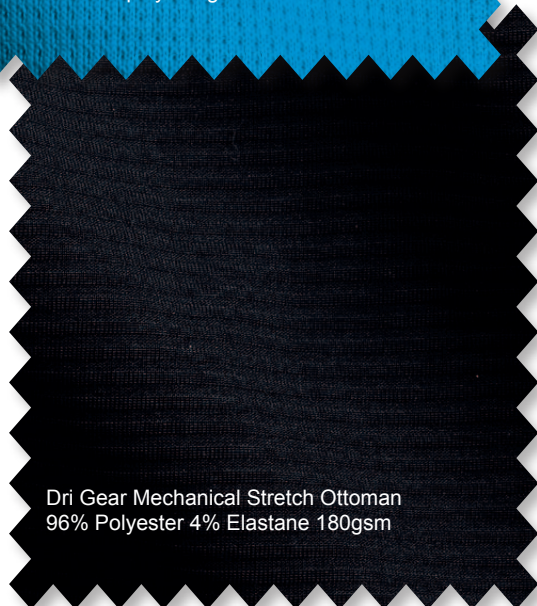
Dri Gear Mechanical Stretch Ottoman 96% Polyester 4% Elastane 180gsm