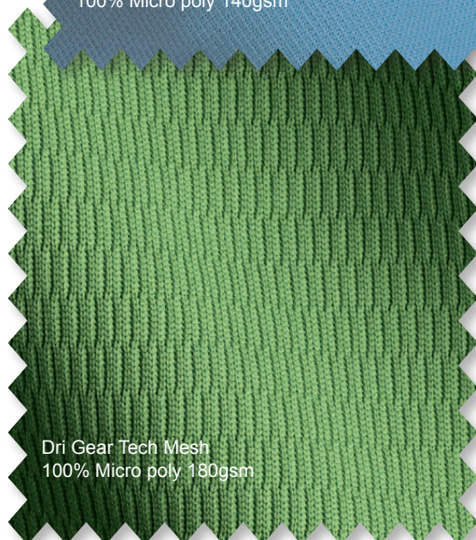
Dri Gear Tech Mesh 100% Micro poly 180gsm