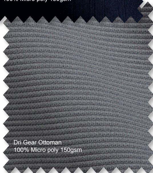
Dri Gear Ottoman 100% Micro poly 150gsm