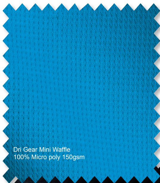
Dri Gear Mini Waffle 100% Micro poly 150gsm