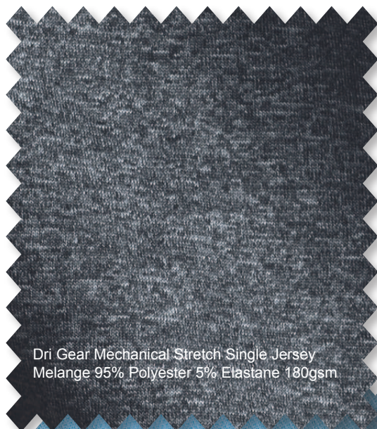
Dri Gear Mechanical Stretch Single Jersey Melange 95% Polyester 5% Elastane 180gsm

Our Dri Gear Collection offers even greater options in high tech moisture management fabrics in a wide range of colours and styles.