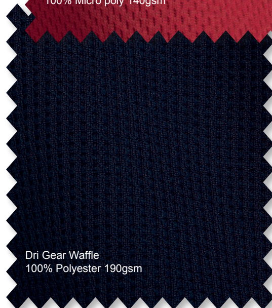
Dri Gear Waffle 100% Polyester 190gsm