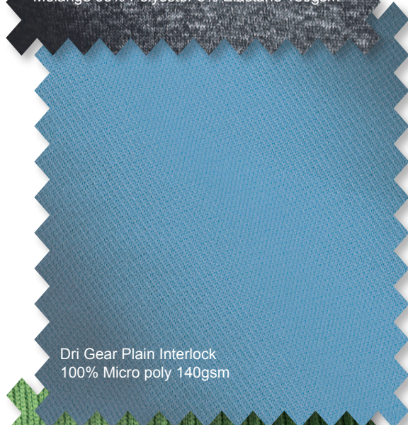
Dri Gear Plain Interlock 100% Micro poly 140gsm