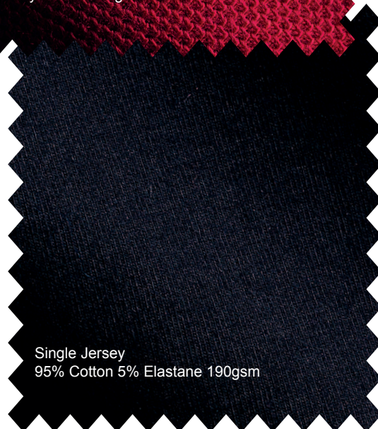
Single Jersey 95% Cotton 5% Elastane 190gsm