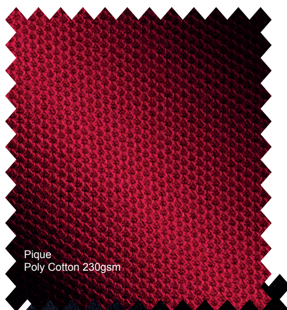
Pique Poly Cotton 230gsm