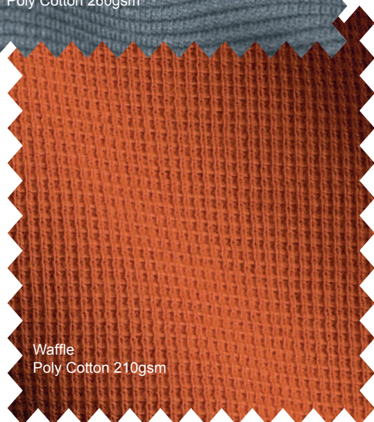
Waffle Poly Cotton 210gsm