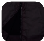
Lined with anti-pill polar fleece