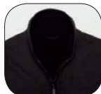
High collar with concealed zip plaquet