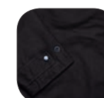
Adjustable sleeve tab with dome closures