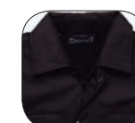
Dome closures on external storm flap