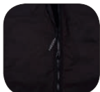
Two way zip with AGRI STATION puller