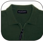
Vislon ½ zip with AGRI STATION puller