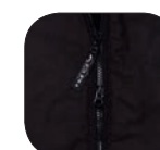
Two way zip with AGRI STATION puller