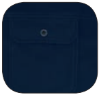
Buttoned chest pockets