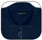
Vislon 1/2 zip with AGRI STATION puller