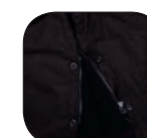
Lined with anti-pill polar fleece