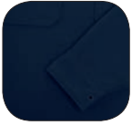
Adjustable button on cuff