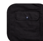
Domed chest pockets