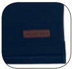
Longer length back hem and AGRI STATION suede badge