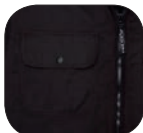
Domed chest pockets